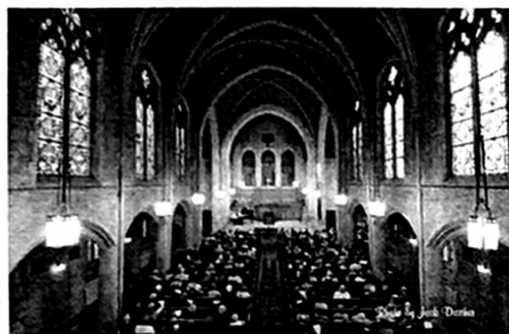
First Presbyterian Church Sanctuary